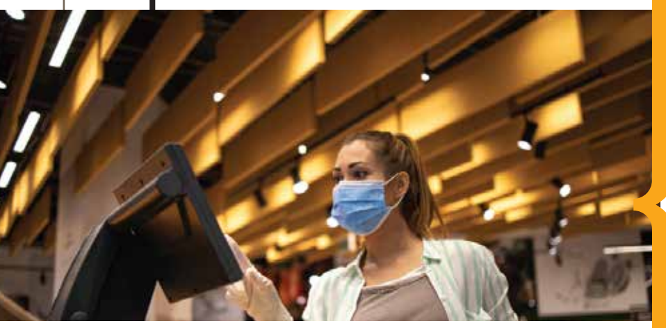
Be a part of the biggest growing family.

In this new age, the world is available at our doorstep in a jiffy. MEGA MART VENTURES INDIA promises in bringing the comfort of an array of products in your neighbourhood. With our stores across 10+ cities, we believe in getting the best at the lowest price, along with the experience of state shopping at a supermarket.