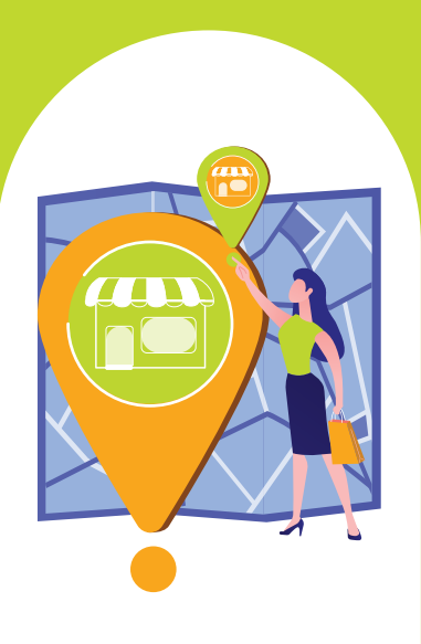
10+ CITIES EXPANDING AND MORE