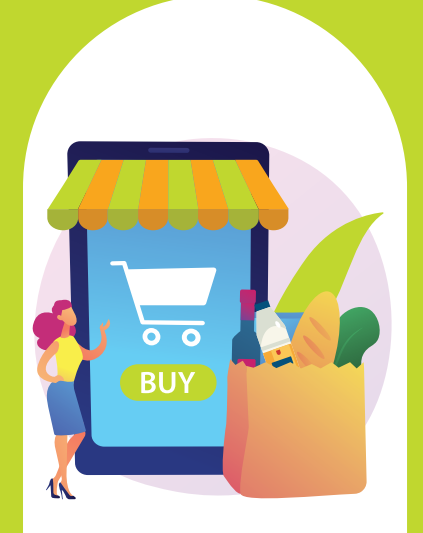
SMART CHOICE FOR SMART PEOPLE